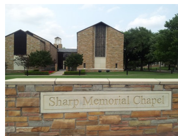
The Chapel at The University of Tulsa, where it all began!