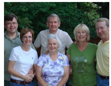
Our friends from Tulsa!