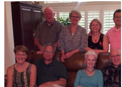
Some of our friends from the Woodlands

We challenge you, if you have some long-time friends you have not kept up with, look them up, get together and celebrate the work of our Lord in each other's lives. You too may feel it is a little bit of heaven here on earth.